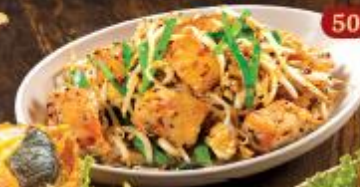
50 香炒萝卜糕 Fried Radish Cake RM12.50