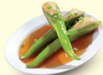
52 豉汁酿辣椒 Chilies (Yong Tau Foo) 3pcs RM9.00