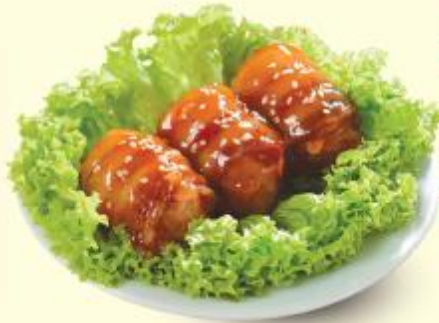
39 蜜汁烟肉卷 Smoked Bacon Rolls 3pcs RM12.50