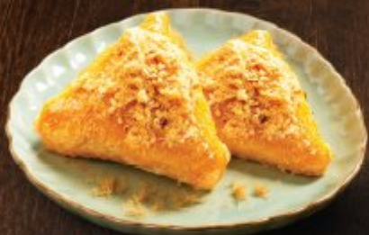
62 肉松叉烧酥 Baked BBQ Pork Puff with Meat Floss (2pcs) RM7.50