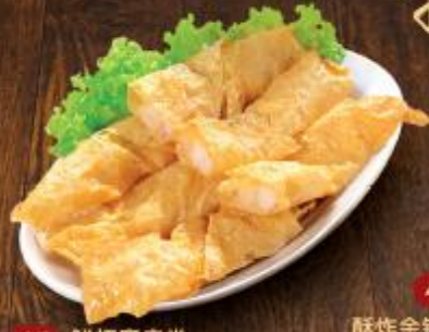
45 鲜虾腐皮卷 Deep Fried Prawn Rolls (3pcs) RM9.00