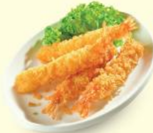
41 天妇罗炸虾 Deep Fried Tempura Prawn 4pcs RM12.50