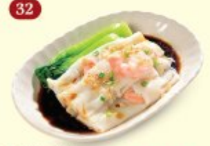
32 鲜虾肠粉 Prawn "Cheong Fun" RM9.00