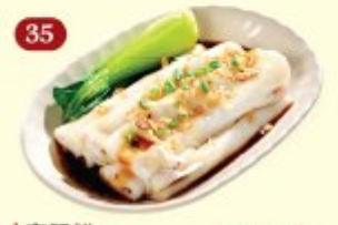
35 斋肠粉 Plain Cheong Fun RM8.50