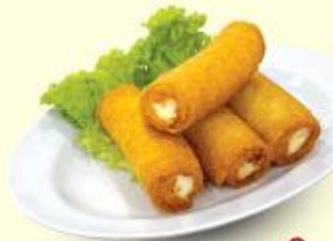
00 炸牛奶卷 Crispy Fried Milk Roll 4pcs RM12.50