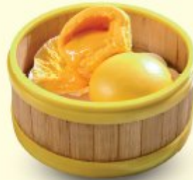
25 咸蛋流沙包 Steamed Golden Salted Egg Bao 2pcs RM8.00