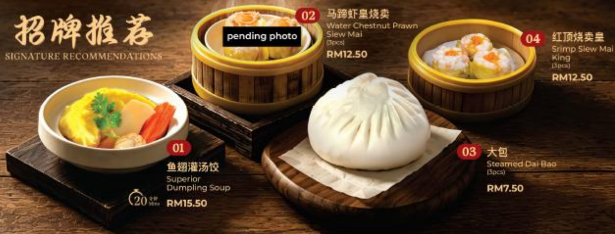
01 鱼翅灌汤饺 Superior Dumpling Soup RM15.50