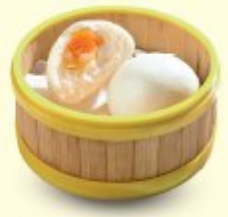
27 蛋黄莲蓉包 Steamed Lotus Paste Bao With Salted Egg 2pcs RM7.50