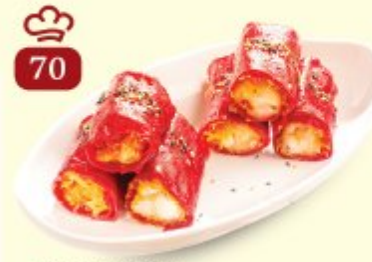
70 金沙红米肠 Golden Crispy Red Rice Roll RM18.00