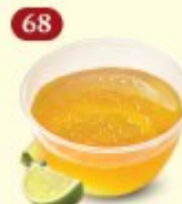
药膳龟苓膏 Chinese Herbal Pudding RM5.50