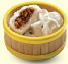
24 蜜汁叉烧包 Steamed "BBQ" Bao 2pcs RM7.50