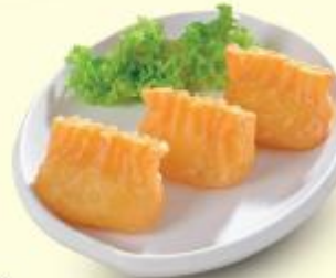
46 沙律明虾角 Deep Fried Salad Prawns 3pcs RM9.00