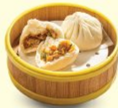
22 生肉包 Traditional Sang Yuk Bao 2pcs RM8.00