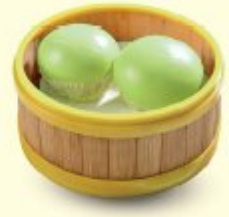
28 香叶加央包 Steamed Pandan Kaya Bao 2pcs RM7.50