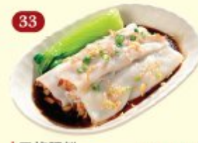
33 叉烧肠粉 BBQ Pork "Cheong Fun" RM9.00