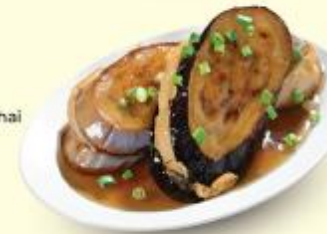
51 豉汁酿茄子 Eggplants (Yong Tau Foo) 3pcs RM9.00