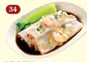
34 鸳鸯肠粉 Mixed "Cheong Fun" RM9.00