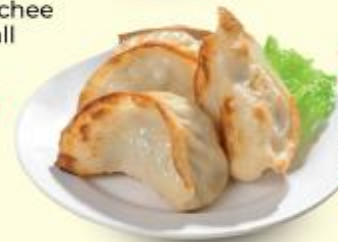
49 上海煎锅贴 Pan Fried Shanghai Dumplings 3pcs RM9.00