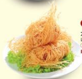
47 龙须虾卷 Long Xu Prawn Rolls 3pcs RM9.00