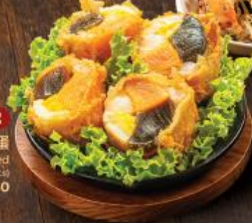
42 酥炸金银蛋 Deep Fried Golden Egg Bock RM12.50