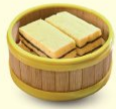
30 麻香糕 Steamed Layer Cake with Black Sesame Paste 2pcs RM7.50