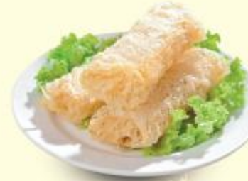
40 越南网虾卷 Crispy Shrimp Rolls 3pcs RM12.50