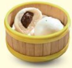
26 香滑豆沙包 Steamed Red Bean Paste Bao 2pcs RM7.50