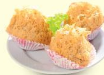
48 蜂巢炸芋角 Deep Fried Crispy Yam Dumplings 3pcs RM9.00