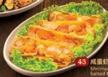
43 咸蛋虾卷 Shrimp Roll with Salted Egg (3pcs) RM12.50