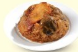
29 风味糯米鸡 Steamed Glutinous Rice 1pc RM8.00