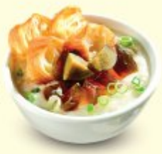
31 皮蛋瘦肉粥 Porridge with Minced Pork & Century Egg RM6.50