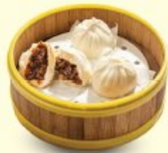
23 一口叉烧包 Mini BBQ Pork Bao 3pcs RM7.50